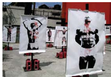
Blue Habeas Corpus By Jack Beng-Thi at FOKAL, Haiti.