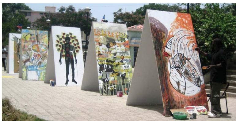
"Painting In the City"- Place Canapé-Vert, Port-au-Prince. Various Artists

2011: The 6th Transcultural Forum of Contemporary Art took place in Port-au-Prince, Pétion-Ville and Croix-des-Bouquets, from Sunday September 25th to Monday October 3rd 2011.